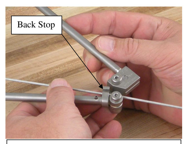
Figure 1: Install coax in bend die groove and then rotate up the back stop as shown with your left ring finger or middle finger as shown.

The NC Series coax benders are designed to make precision bends in a piece of coax cable. Follow the figures below to make a bend in a piece of coax cable.